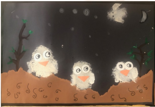
Mixed media baby owl pictures based off of the book Owl Babies by Martin Waddell