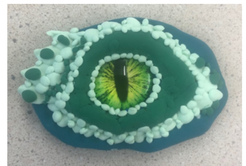
Dragon eye sculpture using model magic clay.