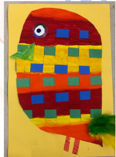
Using warm and cool colors to make a paper weaving bird.