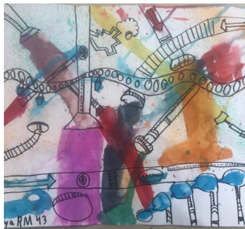
Making our own illustration based on the book Color Blocked by Ashley Sorenson