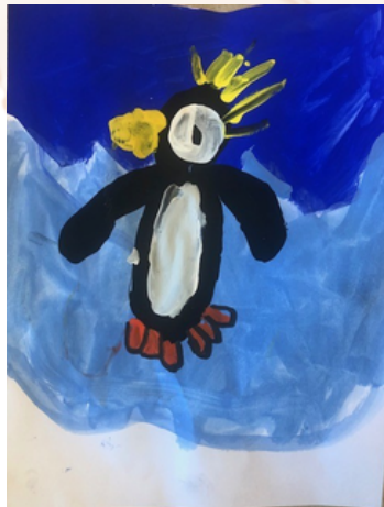
Improving our painting skills to make penguins.