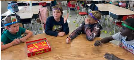
Coffee Cart Club