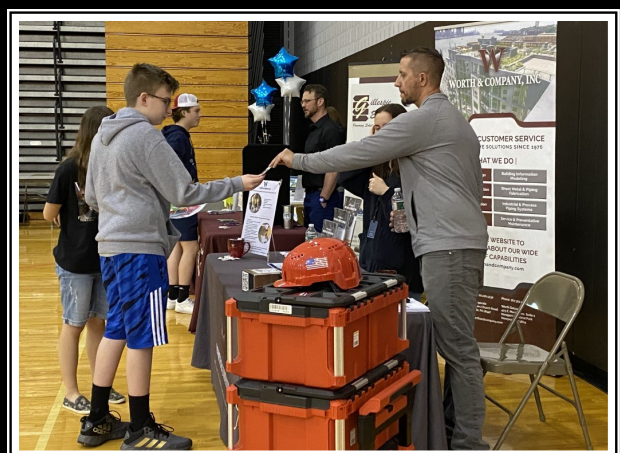
SAHS JOB FAIR